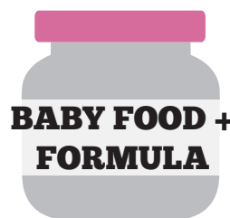
BABY FOOD + FORMULA