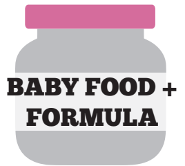
BABY FOOD + FORMULA